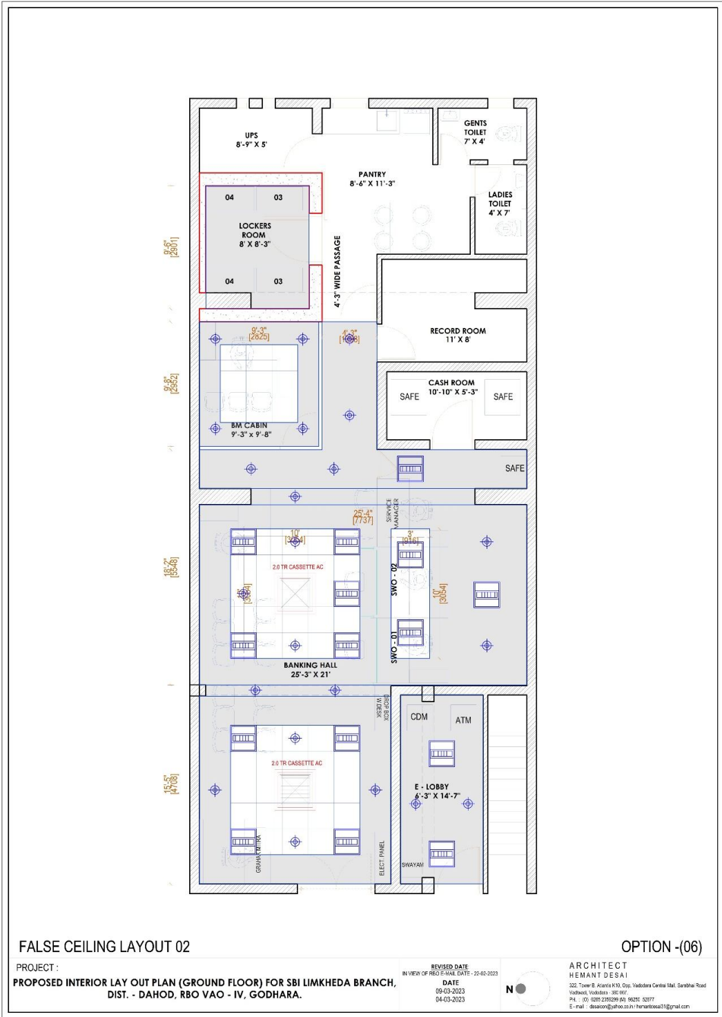
FALSE CEILING LAYOUT 02